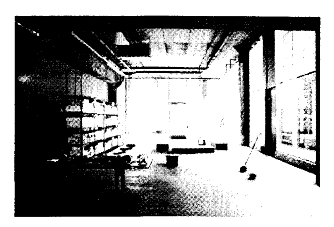
Fig. 4. Demo Home, Richmond Street, Toronto, August 1994, view from rear.

recycled collected plastic bags, taped together and suspended in the space as a giant painting, humbly referencing an ideal enormous scale.