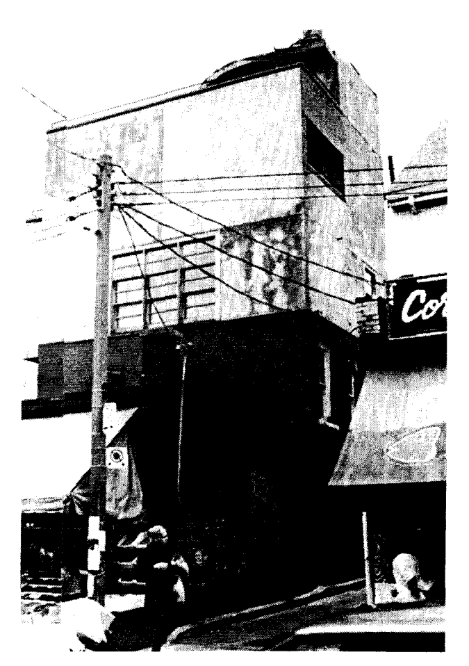
Fig. 1. Kensington Tower, Baldwin Street, Toronto.

In the autumn of 1976, for an exhibition in Berlin, "New York - Downtown Manhattan: Soho," Maciunas and a group of Fluxus artists worked in installation format, designing a Flux-Labyrinth that incorporated a range of humourous, spatial-perceptual experiments.