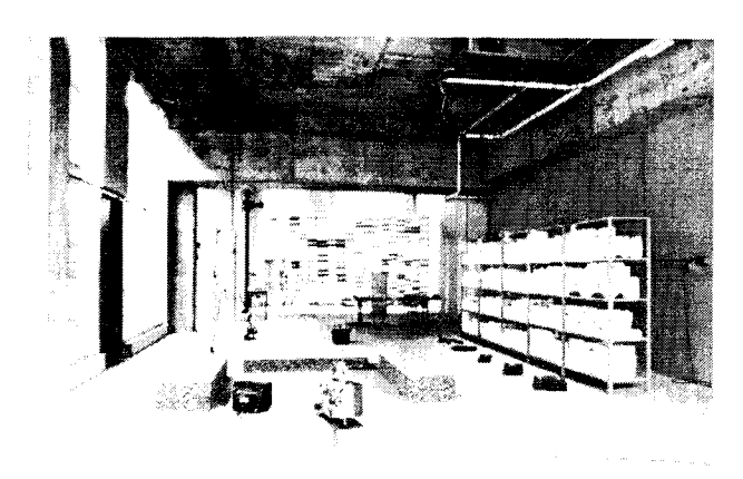
Fig. 3. Demo Home, Richmond Street, Toronto, August 1994, view from entrance.

project, and as landlord for the lower units. Recently Peacock worked in the development phase with architect Terence van Elslander, participating in the planning of a project of a similar nature down the street, on Augusta near Baldwin.